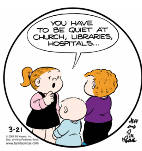
"...and when Mommy's on the phone."