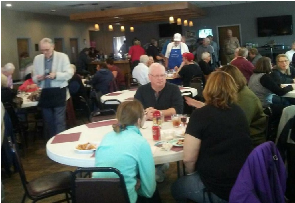
Most important - Our community which attended steadily to support our charitable causes.