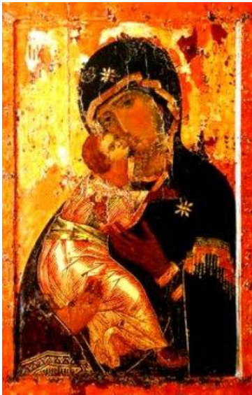
Our Lady of Kyiv, Pray for Ukraine

Please help support the Ladies at our next Burger Night on April 21st.