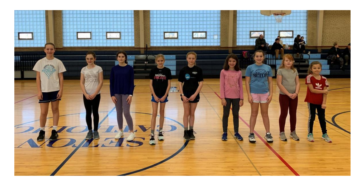
Free Throw Championship - Girls