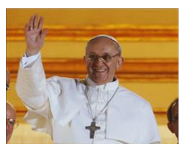
Pope Francis' Prayer Intentions for January

Vatican City, 1 January 2022 (VIS) – The Holy Father's prayer intention for January – True Human Fraternity "We pray for all those suffering from religious discrimination and persecution; may their own rights and dignity be recognized, which originate from being brothers and sisters in the human family."