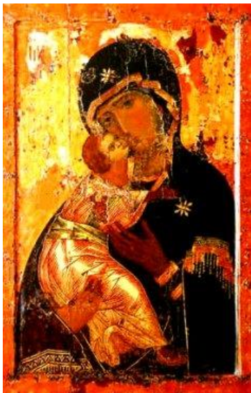
Our Lady of Kyiv, Pray for Ukraine

Please help support the Ladies at our next Burger Night on June 16th.