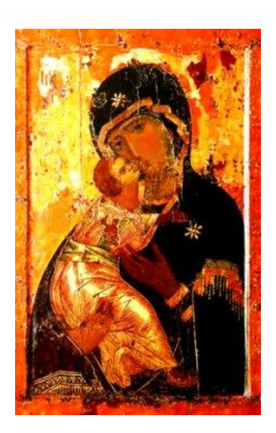
Our Lady of Kyiv, Pray for Ukraine