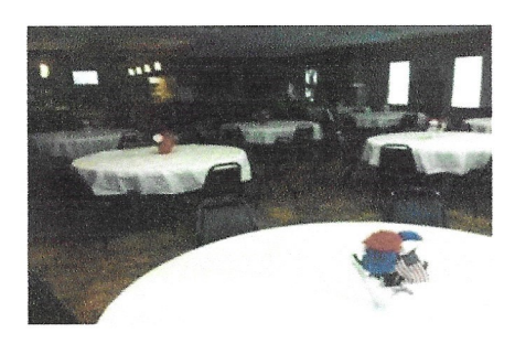
Full bar & bartender available

parties weddings meetings reunions family gatherings fund raisers brat fries Showers It will meet all your needs, Tell your friends and relatives!