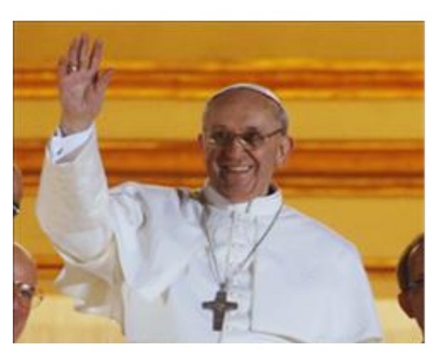
Pope Francis' Prayer Intentions for September

Vatican City, 1 September 2023 (VIS) – The Holy Father's prayer intention for September – For the cry of the earth "We pray that each one of us will hear and take to heart the cry of the Earth and of victims of natural disasters and climactic change, and that all will undertake to personally care for the world in which we live."