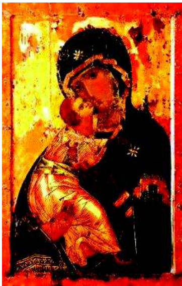
Our Lady of Kyiv, Pray for Ukraine

Please help support the Ladies at our next Burger Night on June 16th.